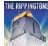
Celebrate The Rippingtons: 20th Anniversary